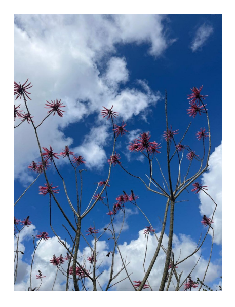
Coralbean (Erythrina herbacea)

IRC has an E-Trade account. Please contact us about giving gifts of stock.