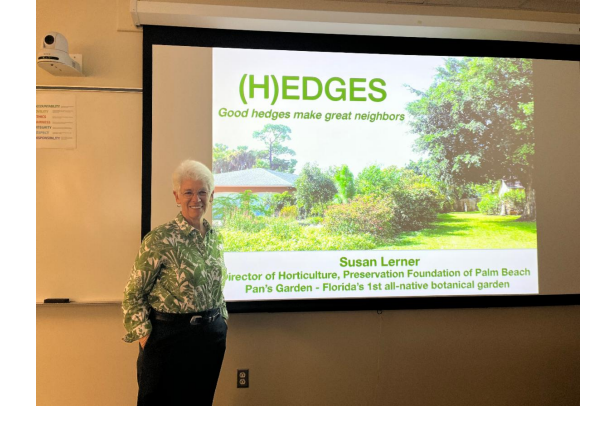
A caracteristic de la caracteristic Reservation of rare plants, suisants, aud excervator